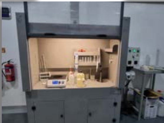
Inductively Coupled Plasma (ICP)